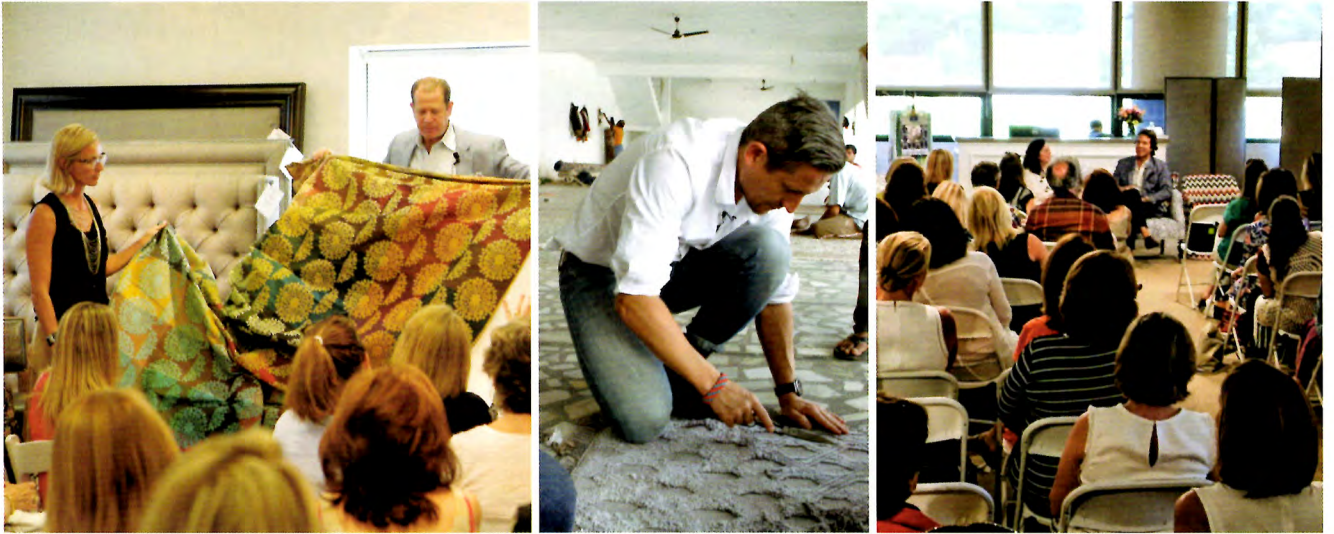
AT THE STAMFORD WATERSIDE DESIGN DISTRICT (FROM LEFT): DESIGNER CANDICE OLSON AT THE KRAVET SHOWROOM, A DEMONSTRATION AT THE J.D. STARON SHOWROOM, JOHN ROBSHAW TALKS WITH A RAPT AUDIENCE

▶ If it's true that there is strength in numbers, the new Stamford Waterside Design District will be a power player in the field of home design. The district, made up of a collection of shops on or near Stamford's Fairfield Avenue that specialize in high-end products for the home, held its inaugural Market Day in early June. The full day of events included an appearance by fabric designer